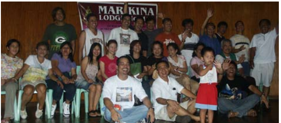
The brethren, sisters, children and friends of Marikina Lodge No. 119 pose for posterity during the 59th Anniversary Celebration.